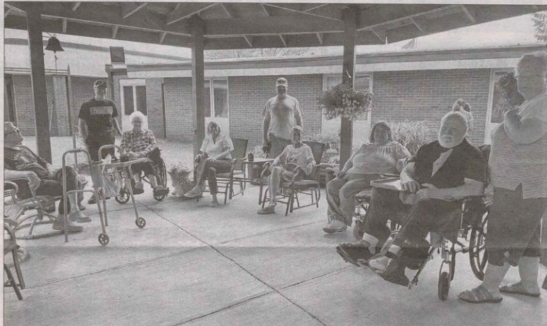
Residents at Evansville Manor are excited to view the changes made to the outdoor area.

Check out your local BUSINESS DIRECTORY!