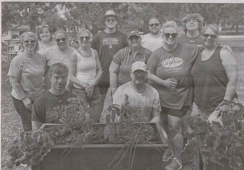
Evansville Examiner

HOMETOWN COMPUTER PROS BUSINESS & RESIDENTIAL SALES & SUPPORT In-Store & Onsite Service 605 E. Main Street Evansville, WI 53536 Office: 608-882-0680 www.hometowncomputerpros.com