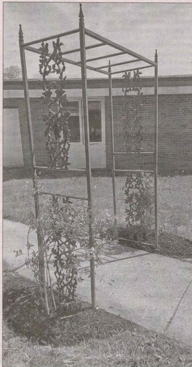
A trellis at the Evansville Manor helps beautify the outdoor space.

Thanks to the Evansville Manor for the excitement and hospitality they shared. Hopefully they love their "green" new outdoor space.